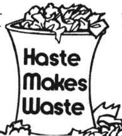
AN OUNCE OF PREVENTION

Recently I ordered some replacement parts for an older Hy-Gain Antenna that I will put up shortly (TH3-JR). I was referred to a toll free number for technical advice: (1) (800) 328-3771 and spoke to Mr. Al Kaplan who was very helpful and who made the following recommendation: When assembling aluminum tubing sections first brush mating surfaces with 000 steel wool and then coat lightly with an anti-oxidant preparation. He specified "Pennetrax-A", a Greenlee Product, the "A" designating the aluminum formula. Failure to prepare joints thusly eventually results in corrosion and resistive joints. (Which will alter and probably degrade antenna performance) He also said the common practice of spraying "Krylon" or a similar urethane coating over a tubing joint will protect for a while, but eventually moisture will produce corrosion. I was unable to locate any "Pennetrax-A" locally, but found the following substitutes at a local electric wholesale supply: "NO-LOX" by Ideal Corp. 8 ozs. for $4.15 and "DE-OX" by ILSCO Corp - 8 ozs. for $4.15. Both available from Union Wholesale Electric Co. 1509 W. Valley Blvd. Alhambra (818) 289-6142. They stock the products for applications such as joining aluminum sections of high-current buss-bars, and will sell over-the-counter. (Jason N6BCI)