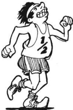
JPL AMATEUR RADIO CLUB MEMBERS SUPPORT FIRST LA MARATHON

Twelve members of the JPL Amateur Radio Club provided communications support for the first Los Angeles Marathon on Sunday, March 9. A total of 267 amateur radio operators provided support to over 11,000 runners. The 26.2 mile course started and finished near the Coliseum. Several nets operated simultaneously on the 144 and 220 MHz bands. Runner timing information was handled by volunteers on the 470 MHz business band.